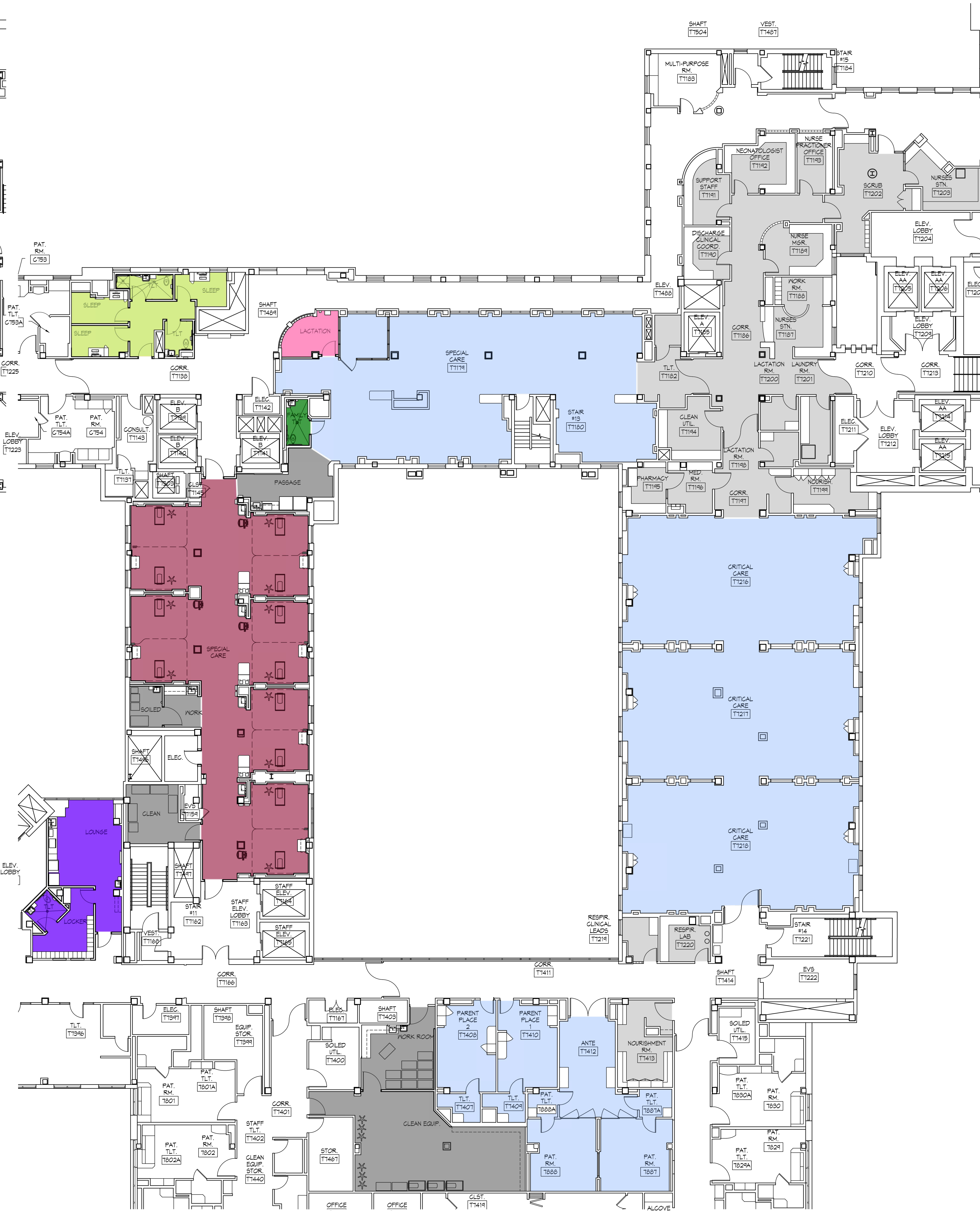
NEW FLOOR PLAN